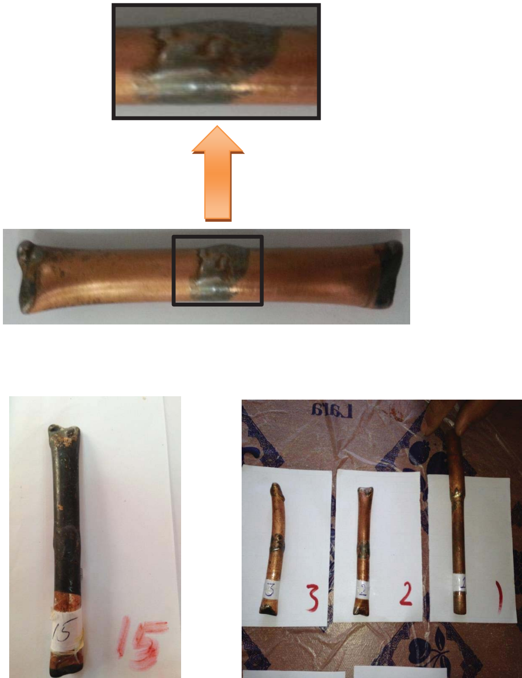
Fig. (4) Magnification of The welding area of the model number (4) encased by mix No. 4