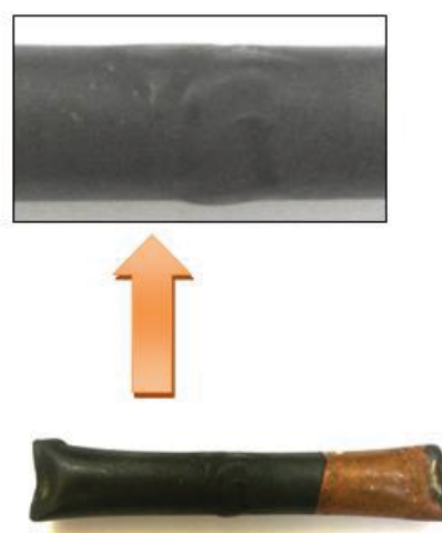
Fig. (3) Magnification of The welding area of the model number (3) encased by mix No. 3